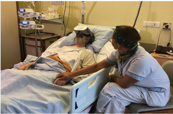
Figure 3: The virtual reality headset decreases the anxiety of the intensive care patient.