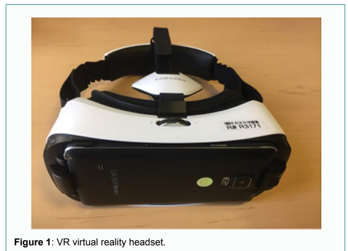
Figure 1: VR virtual reality headset.

VR as an educational tool offers feasible digital solutions to this problem as students focus on a virtual space where distractions are greatly reduced. One approach to using virtual reality in classrooms