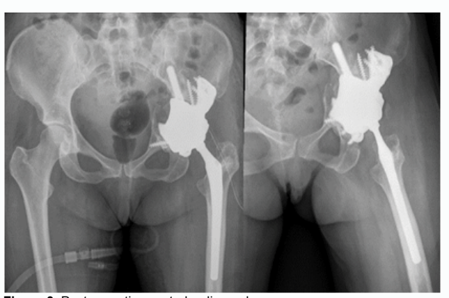
Figure 3: Post-operative control radiographs.

Pelvis discontinuity is an infrequent but serious complication that poses a challenge for orthopedic surgeons. Acetabular reconstruction using a custom-made prosthesis is a good alternative in patients who have undergone previous revision arthroplasties and present significant acetabular defects. This strategy allows reconstruct bone stock deficits and provides postoperative stability.