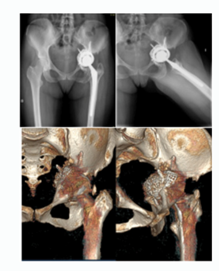
Figure 1: PA and axial hip radiographs and 3D reconstructions.