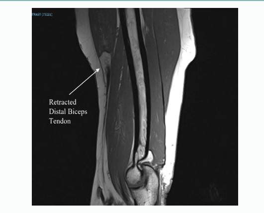
Figure 1: MRI evidence of distal biceps tendon retraction.

tendon allograft distally was completed prior to proximal fixation to native biceps tendon in all cases, as it allowed for the proper tension to be set. An 8 mm hole was drilled and reamed bicortically through the radius. At this point an Endobutton was secured with fluoroscopy confirmation for proper positioning (Figure 3). The graft was then secured to the distal biceps tendon muscle tendon unit using multiple independent and a running locked 3-0 FiberWire sutures, ensuring appropriate tension such that flexion, extension, pronation, and supination of the arm were preserved (Figure 2C). The incision was closed primarily (Figure 4), and all patients were placed in a hinged elbow brace restricting motion from 30 to 90 degrees of flexion.