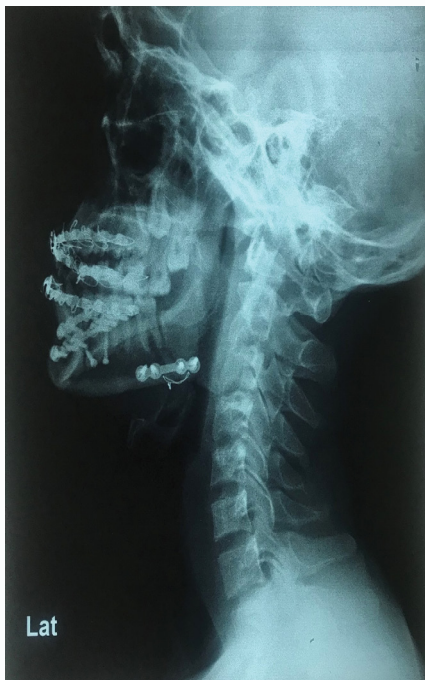
Figure 3: Lateral view of neck x-ray.