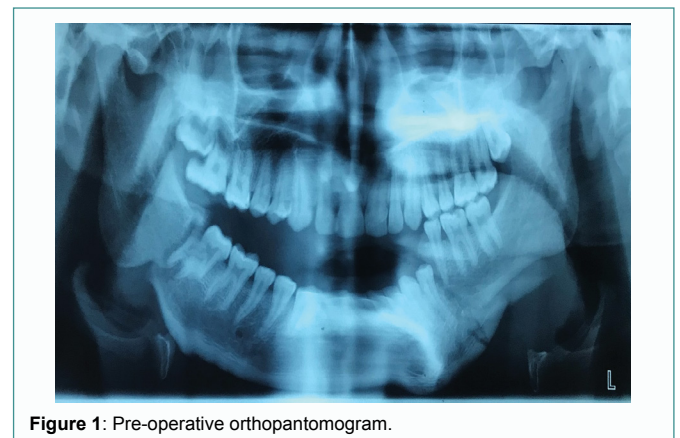
Figure 1: Pre-operative orthopantomogram.

Postoperative OPG (Figure 2) showed adequate reduction and fixation of both fracture sites, but the tooth which was present in the line of fracture in the right-angle fracture was found missing. To rule out tooth displacement into the neck spaces, abdomen and lungs;