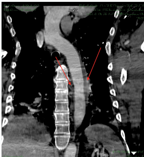
Figure 2: Computed tomography thorax images showing an aortic wall hematoma. The red arrows point to the location of the hematoma.

of aortic hematoma. In this context, ECULIZUMAB treatment has definitively stopped. The patient has never relapsed.