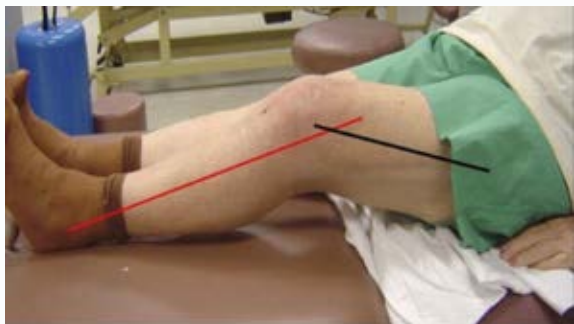
Figure 1: Fixed flexion deformity of the knee joints.

bony enlargement and flexion deformity tended to be associated especially with tibio-femoral osteoarthritis [16].