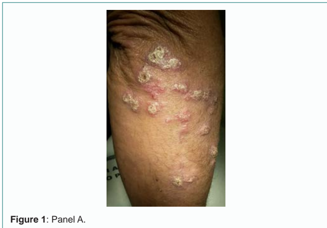
Figure 1: Panel A.

Citation: Zogbi L, Juliano C, Andrade F. Chromomycosis - A Clinical Image. Ann Clin Image Short Rep. 2018; 1(2): 1007.