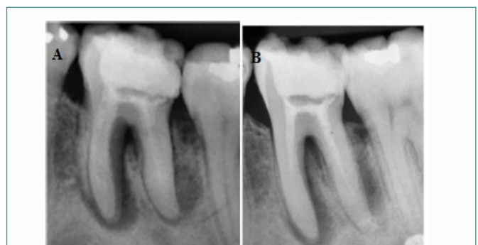
Figure 2: (A). Radiograph of tooth 36 after intracanal medication (14 days). (B). Change of intracanal medication (21 days).

Fourteen days after completion of subgingival scaling, endodontic treatment of tooth 36 was started. Purulent exudate drained from the coronal opening. Odontometry was performed (distobuccal canals: 23 mm, mesiobuccal canals: 21 mm, distolingual canals: 21 mm and mesiolingual canals: 21 mm), followed by chemical-mechanical preparation using irrigation with 2.5% hypochlorite (Asfer®, São Caetano do Sul, SP, Brazil) and instrumentation with Protaper rotary system (Dentisply®, Petrópolis, RJ, Brazil) up to F2 in all conduits. The intracanal medication used was a paste composed of PA calcium hydroxide (Biodinam®, Ibioporá, PR, Brazil), propylene glycol (Medalha Milagrosa compounding pharmacy, Cristalina, GO, Brazil) and iodoform (Biodinam®, Ibioporá, PR, Brazil) (Figure 2A), taken to the conduits with the help of lentulo files (Dentisply®, Petrópolis-RJ, Brazil). Then, the cavity was temporarily sealed with zinc oxide and eugenol (IRM®, Dentisply, Petrópolis, RJ, and Brazil). After 14 and 21 days, the medication was changed with PA calcium hydroxide paste, propylene glycol and iodoform and temporary sealing of the cavity with zinc oxide and eugenol (Figure 2B).