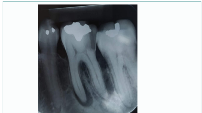
Figure 1: Initial radiograph of tooth 36 with extensive radiolucent area involving the roots.

MB: Mesiobuccal; B: Buccal; DB: Distobuccal; ML: Mesiolingual; L: Lingual; DL: Distolingua