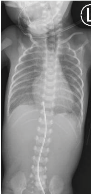
Figure 1: Showing a gas-filled and dilated upper esophageal pouch with a tube terminating at the T3 level and a gasless abdomen. The umbilical venous catheter is also visible.

Gilliard dilator. Following endoscopic dilation, the patient's condition improved, began to tolerate oral feeding, and was subsequently discharged. Three additional endoscopic dilation sessions were performed on the patient, with the last dilation caliber measuring up to 9 cm.