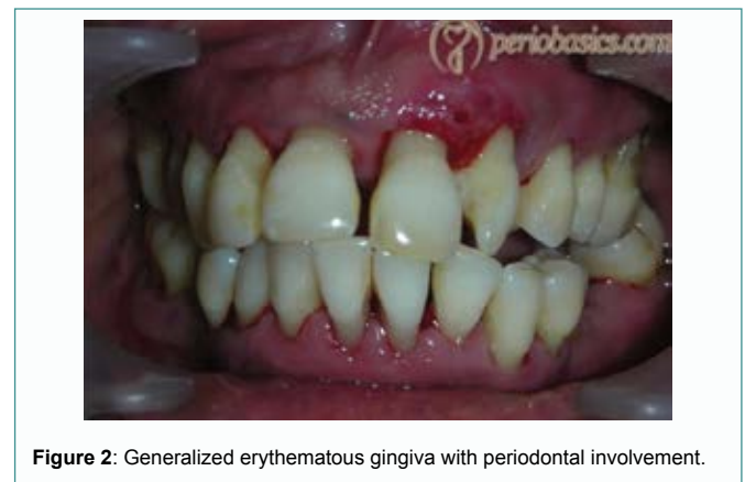
Figure 2: Generalized erythematous gingiva with periodontal involvement.