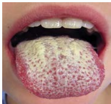
Figure 3: White homogenous patches on dorsal surface of tongue.