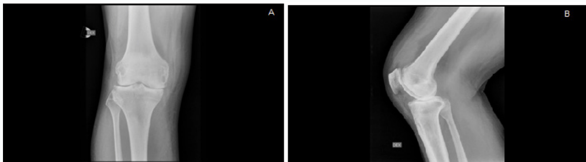
Figure 3: X-ray of the right knee.

A. MRI genu sinsagittal view. B. MRI genu sin sagittal view PD. C. MRI genu sin sagittal view PDW SPAIR. D. MRI genu sin coronal view T2. E. MRI genu sin coronal view T1. F. MRI genu sin axial view.png PDW HR SPAIR. G. MRI genu sin axial view.