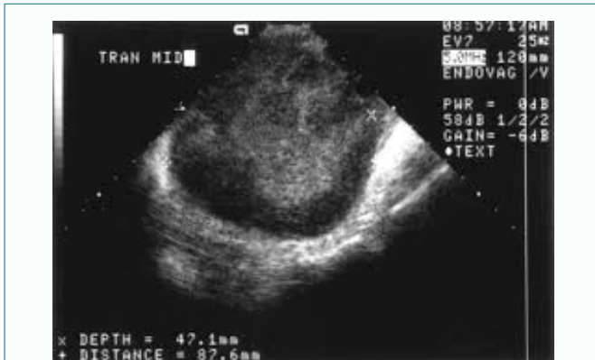
Figure 1: Ultrasonogram of the uterus showing fibroid.

of leiomyosarcoma (high grade). Lympho-vascular invasion was not identified.